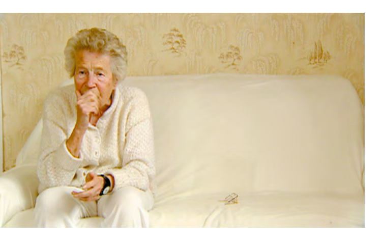
YOU WILL NEVER UNDERSTAND THIS