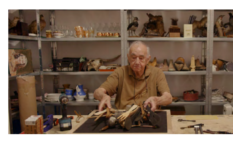
THIS MOVIE IS A GIFT